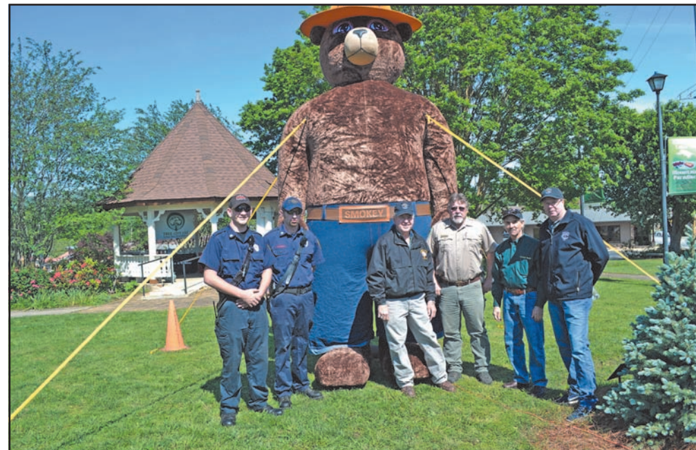
Fire professionals who work in Towns County gathered to promote Wildfire Preparedness Day on the Hiawassee Town Square on Saturday, May 6.